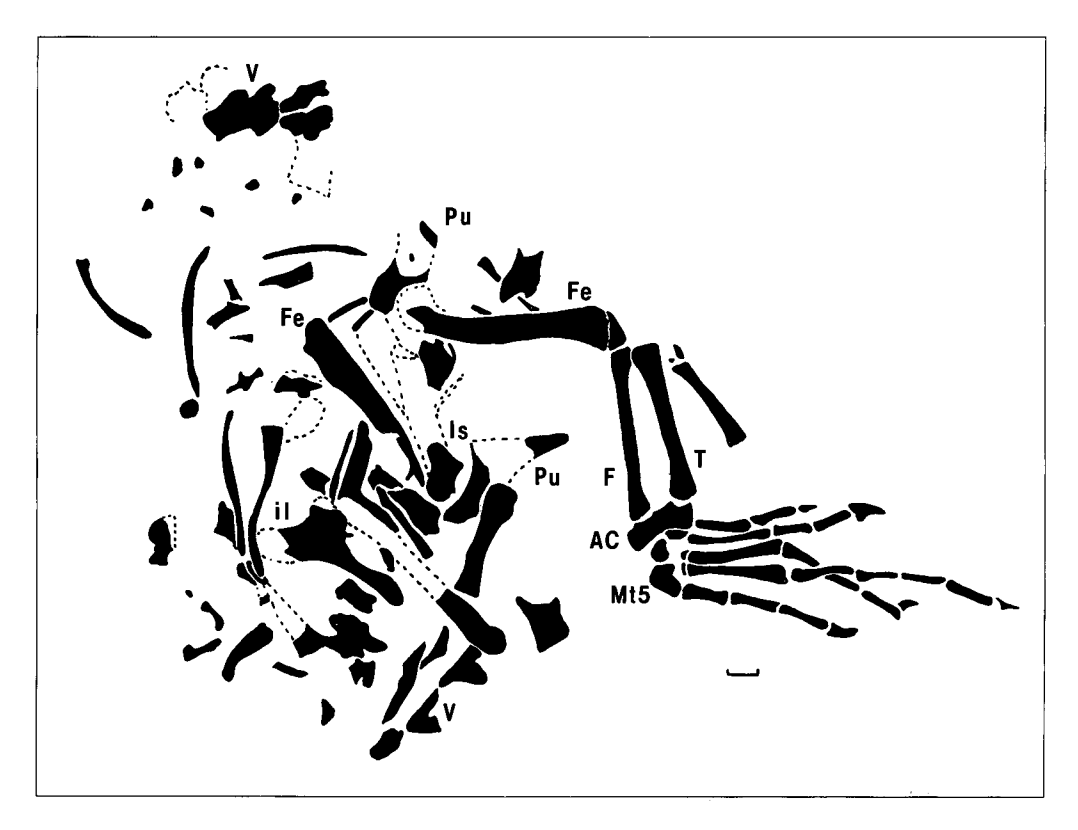
Fig. 1. LP-0098 IEI/G: general plan of the specimen. AC, astragalocalcaneum; F, Fibula; Fe, femur; il, ilium; Is, ischium; Mt5, fifth metatarsal; Pu, pubis; T, tibia; V, vertebrae.

A complete right hindlimb is preserved. The femur (11 mm) is strongly built and typically sigmoid in form. The tibia and fibula are shorter (7 mm) and rather more gracile. In all cases, epiphyses are visible but incompletely ossified. The astragalus and calcaneum are coossified into a large proximal astragalocalcaneum, notched distally for the enlarged fourth distal tarsal. A smaller bony mass flanking dt4 is probably the third distal tarsal. Of the metatarsals, three and four are of similar length (4.5mm); the fifth is short and distinctly hooked, with a large proximal head. The phalangeal formula is 2:3:4:5:4 (not 2:3:3/4:3/4:2).